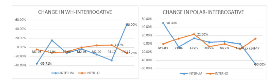
Figure 5.3: Distributive Changes of Wh- and Polar-Interrogatives in Interpretation

As is presented in Figure 5.3, the distributive deviation of wh-interrogatives ranges from -12.28% to 4.97% in INTER-JOs whereas all changes in INTER-JOs are below 12.28%. In INTER-JMs, the change of wh-interrogatives vary greatly among sessions, ranging from -35.71% to 50%. In addition, the distributive change of polar-interrogatives in INTER-JOs ranges from -12.67% to 22.6%. Though, in INTER-JMs, such distributive change is mostly limited, with only two radical spikes of 50% in M1-03 and F3-12.